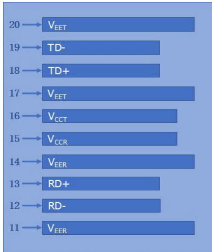
Top of Board