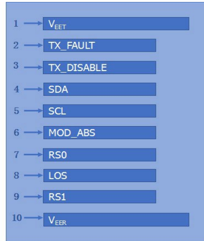
Bottom of Board